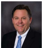
Dale Davis Development