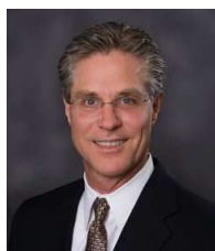
David McDaniel Property Management