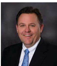
Dale Davis Development